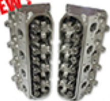
CBM CNC PORTED COMPLETE LS CYLINDER HEADS LS1, LS3, LS6, LS7, LSX, L92, 241, 243, 823