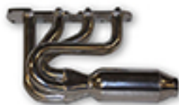
CBM ECOTEC HEADER WITH MUFFLER "Ceramic coated" 2.2L 2.4L L61 L65